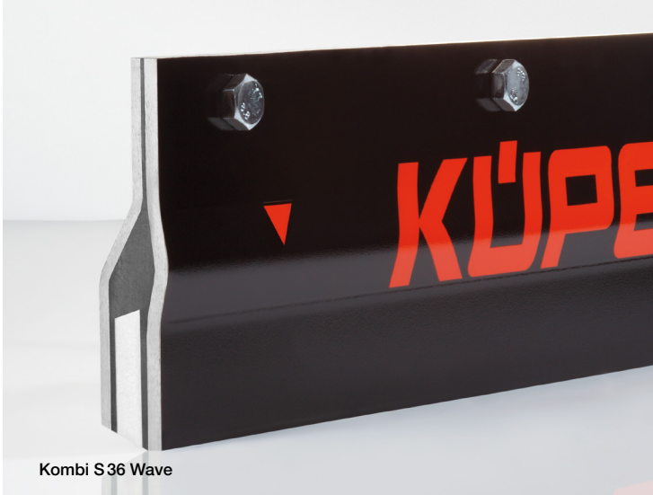
Kombi S36 Wave