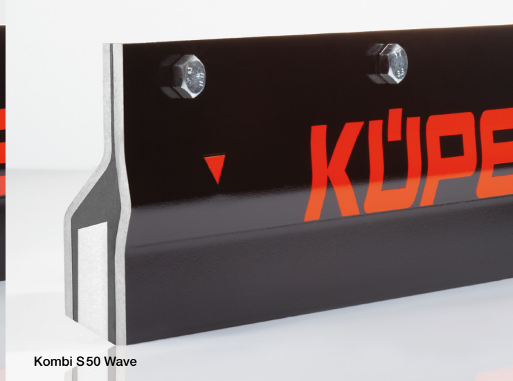
Kombi S50 Wave